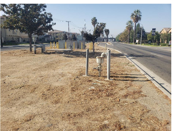
UTILITIES TO BE RELOCATED