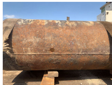
Holes and cracks on the existing Scheuer Well Supply Main