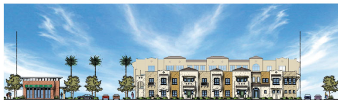
Housing: 7 th and Chicago Entrada Project