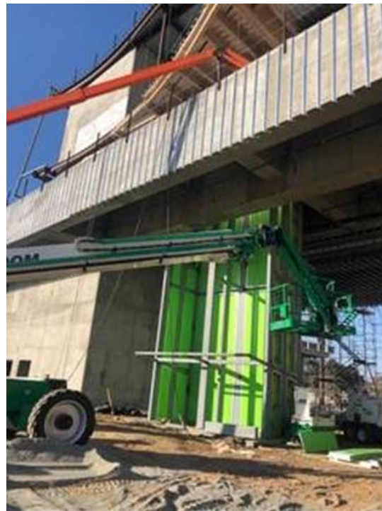
Ground floor public elevators