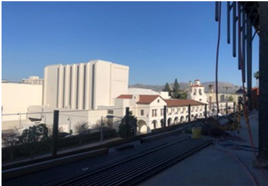
2nd Floor facing Mission Inn Ave.