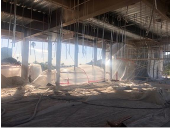
2nd Floor main entrance and stairs