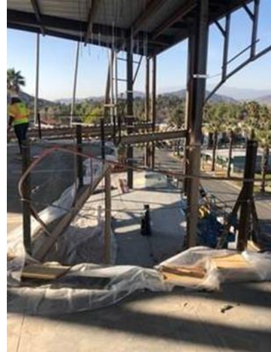
3 rd Floor overlooking 2 nd floor