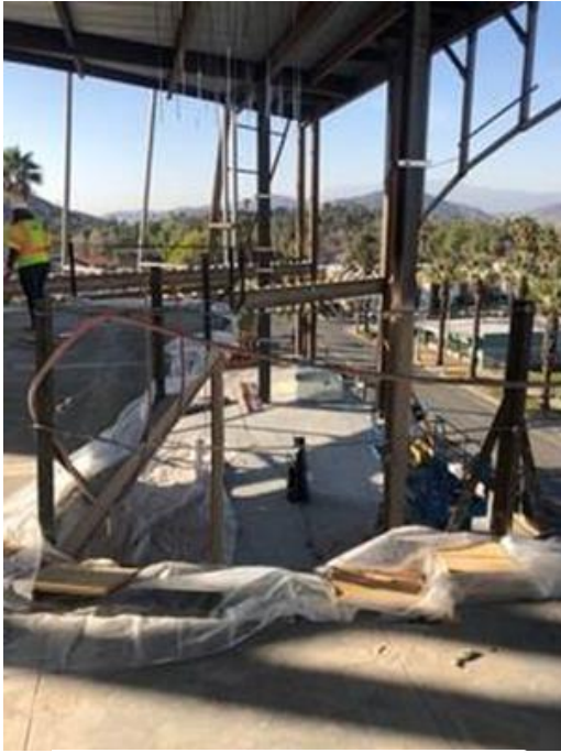
3 rd Floor overlooking 2 nd floor