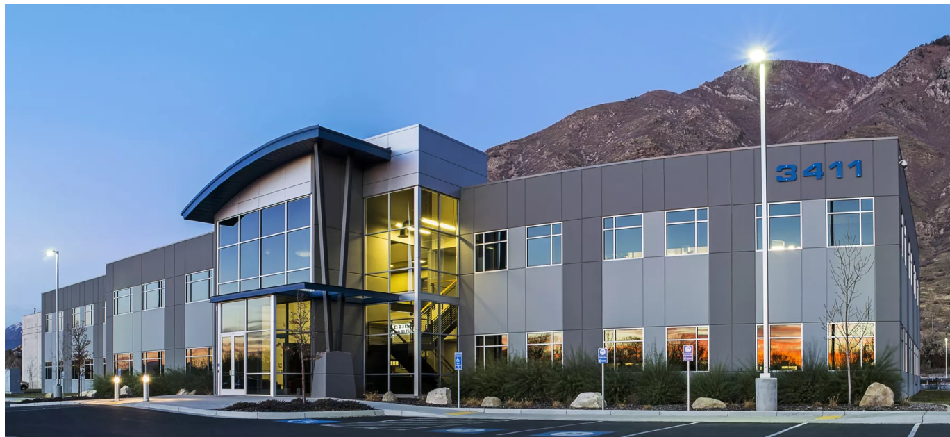
Action Target Headquarters in Provo, Utah

3411 S. Mountain Vista Pkwy Provo, UT 84606