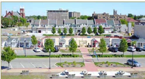
Low Cost Pop-Up Retail