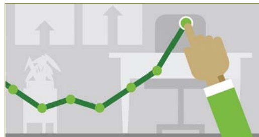
Growth or Stability