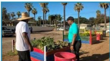
1 st Place Small Sparks Neighborhood Matching Grant Program City of Riverside, CA

The projects in this category recognizes the outstanding programs implemented by governmental entities, businesses, or not for profits to improve neighborhoods.