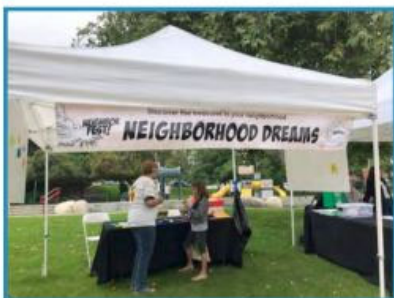
1 st Place Neighbor Fest! City of Riverside, CA

The applications in this category features projects that focus on the social or cultural aspects of a neighborhood like safety, youth and/or senior programs, and activities that make neighbors feel connected and foster neighbors working together like an ice cream social, holiday celebration or festival.