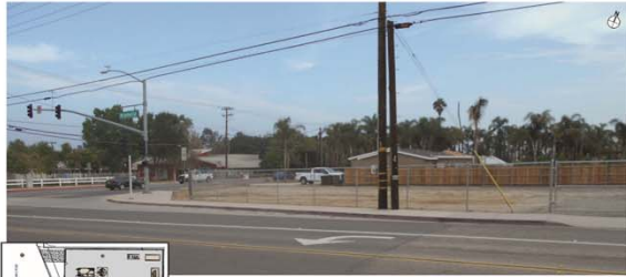
EXISTING SITE PERSPECTIVE A