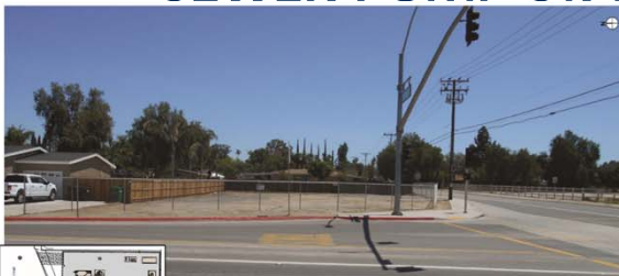
EXISTING SITE PERSPECTIVE 2