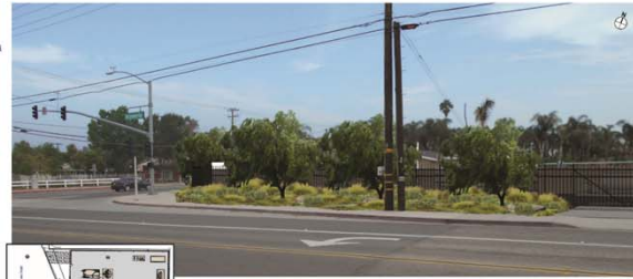
CONCEPTUAL SITE PERSPECTIVE B