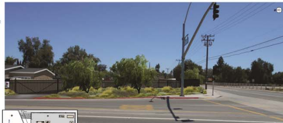
CONCEPTUAL SITE PERSPECTIVE 2