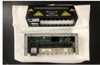
NTRON Switch Internal view