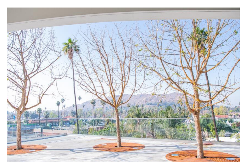
Third Floor Terrace