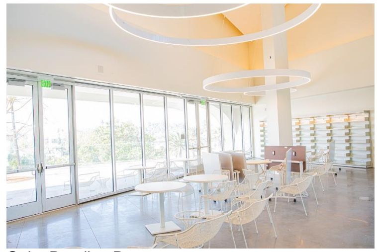
Quiet Reading Room