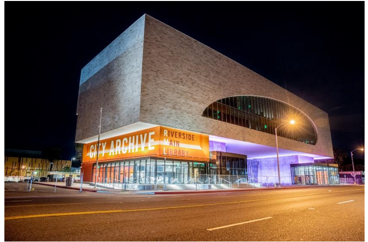
Friends of the Library, City Archive, Community Room