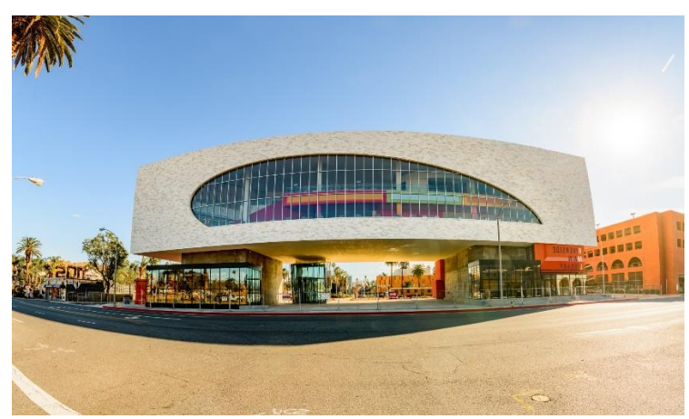
Mission Inn/ Fairmont Avenue View

Below are progress photos taken on January 5, 2021.