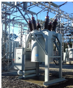
Typical Oil Circuit Breaker (Aged Unit)