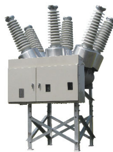
Typical Vacuum Circuit Breaker (Replacement Unit)