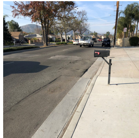
LA SIERRA AVENUE