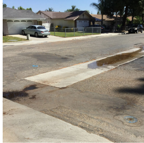
DANIEL DR. @ MODESTO DR.