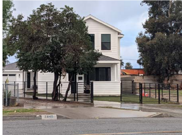
2470 MISSION INN AVE – 2020 APPROVAL