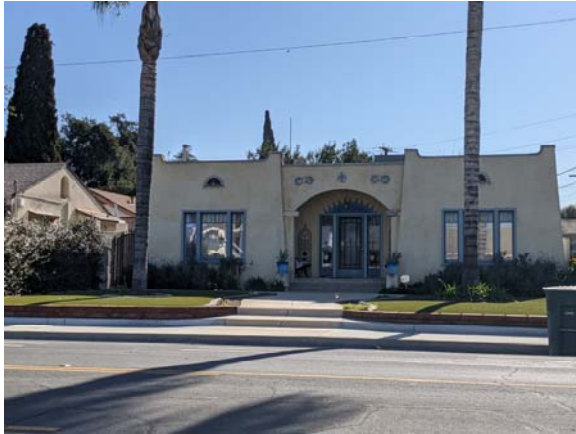
5036 BROCKTON AVE – 2008 APPROVAL