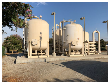
Garner B GAC Treatment Plant

To conduct a full-scale pilot to compare two types of GAC (Granular Activated Carbon) treatment media and understand treatment efficiencies for reducing PFAS compounds from potable water served by RPU.