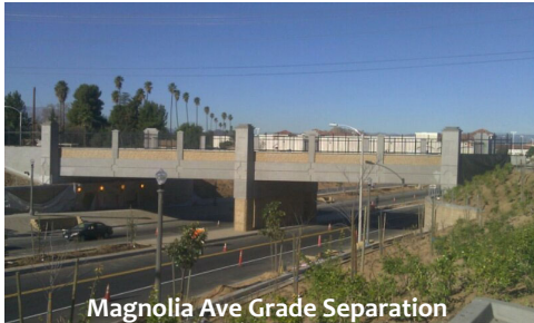
Magnolia Ave Grade Separation