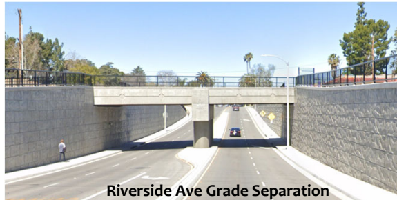
Riverside Ave Grade Separation