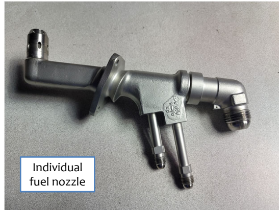
Individual fuel nozzle