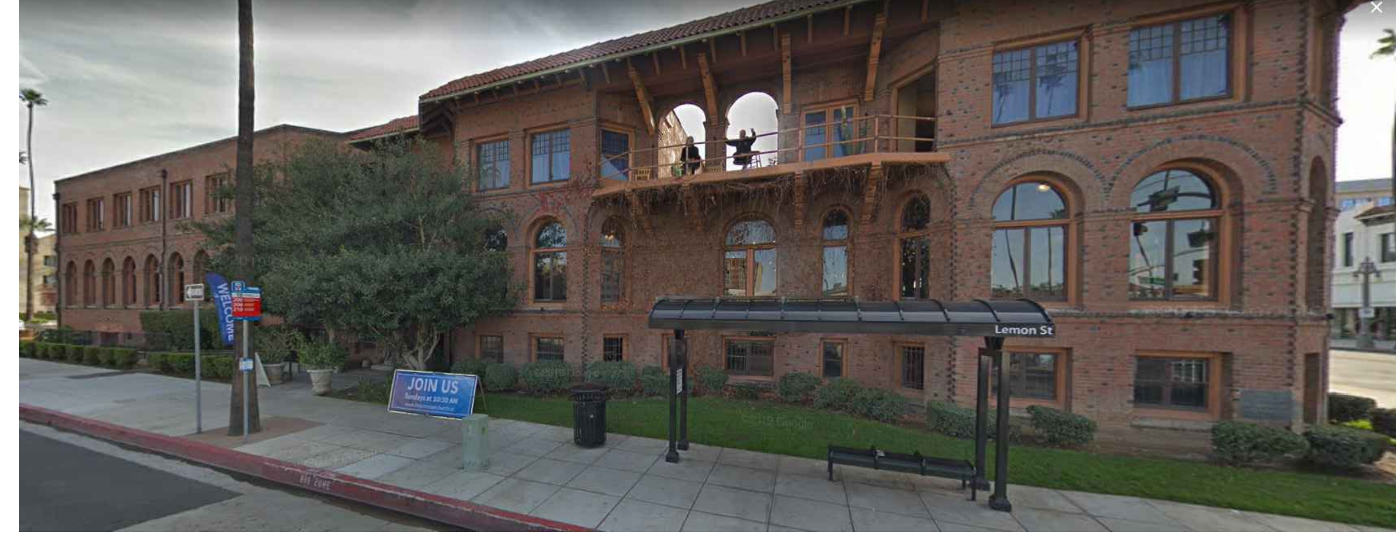
2. LEMON ST. VIEW