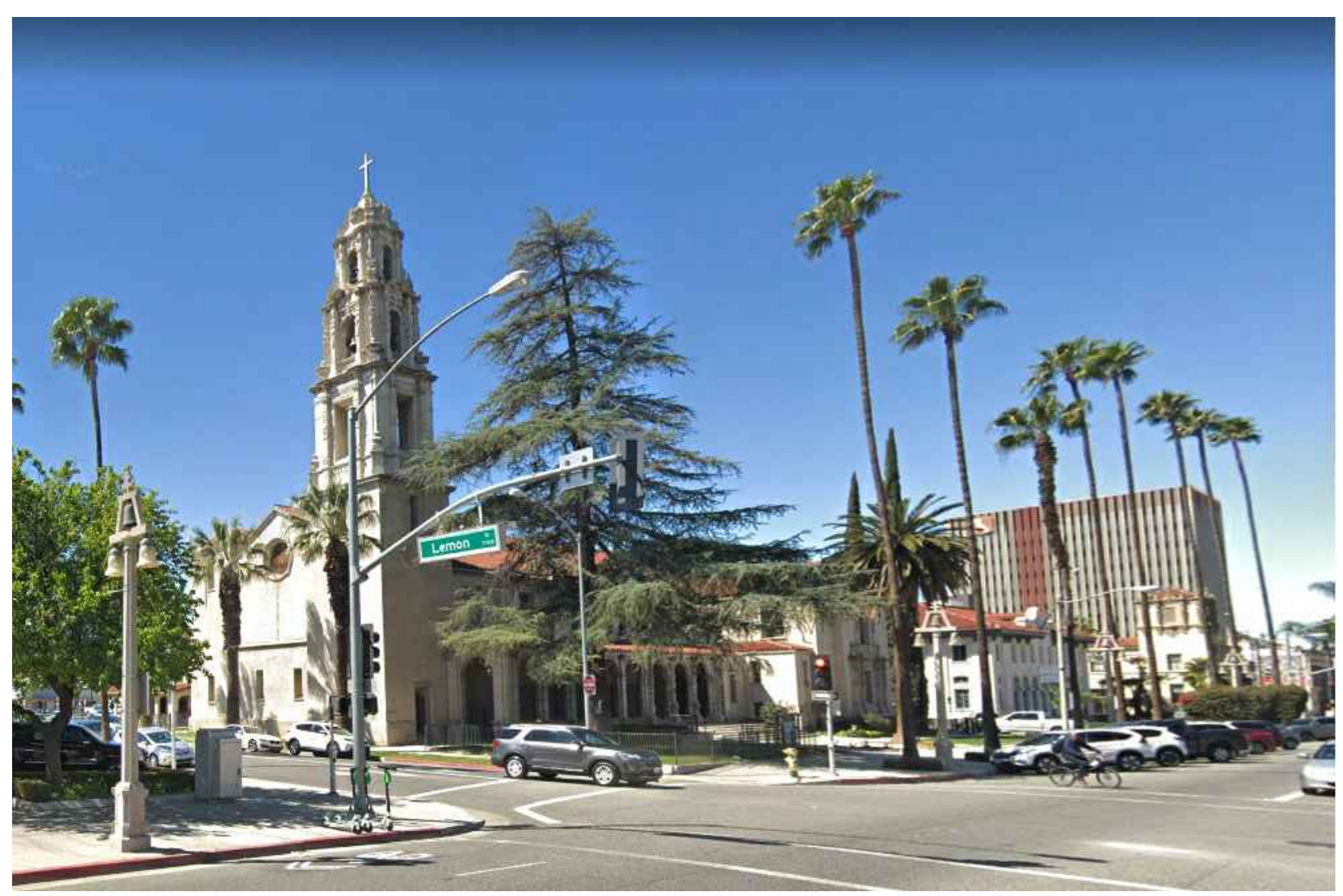
5. LEMON ST. AND MISSION INN BLVD VIEW