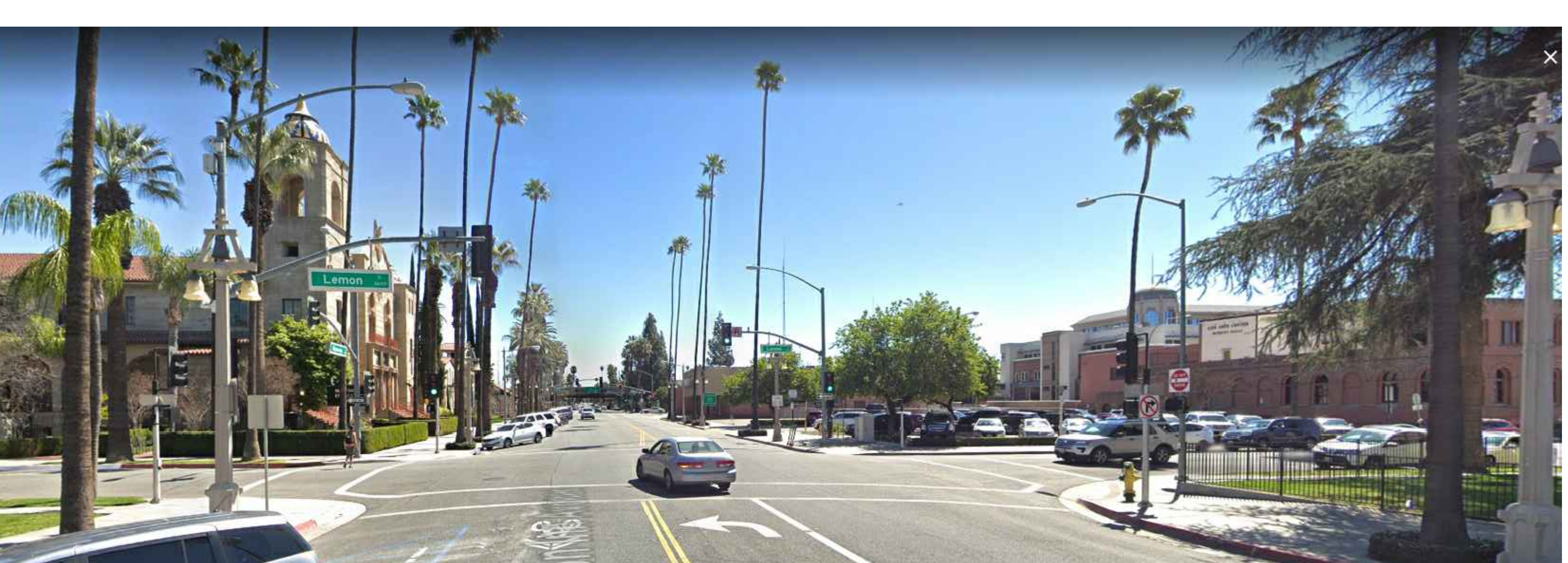
4. MISSION INN BLVD WEST VIEW