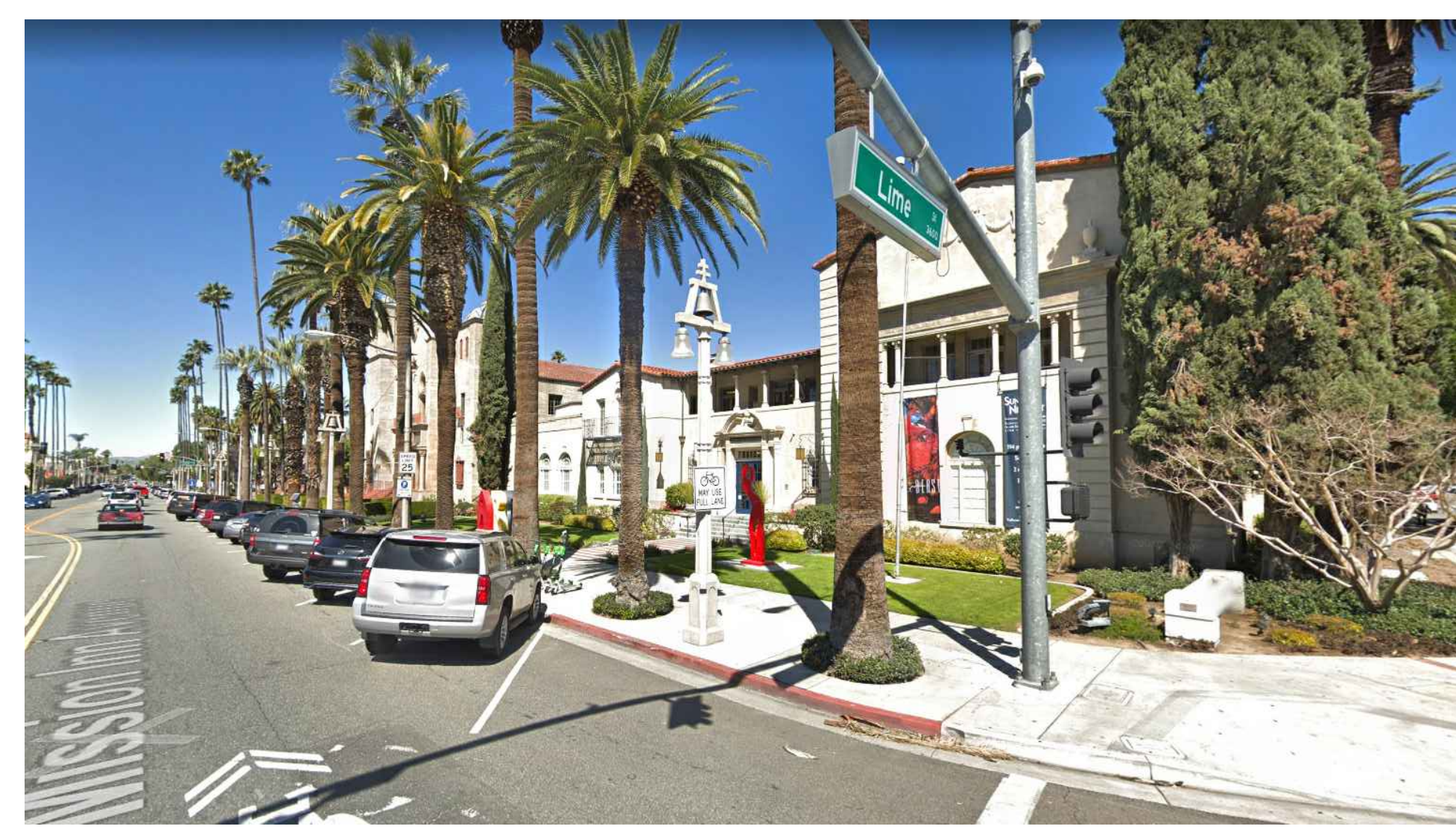
6. MISSION INN BLVD EAST VIEW