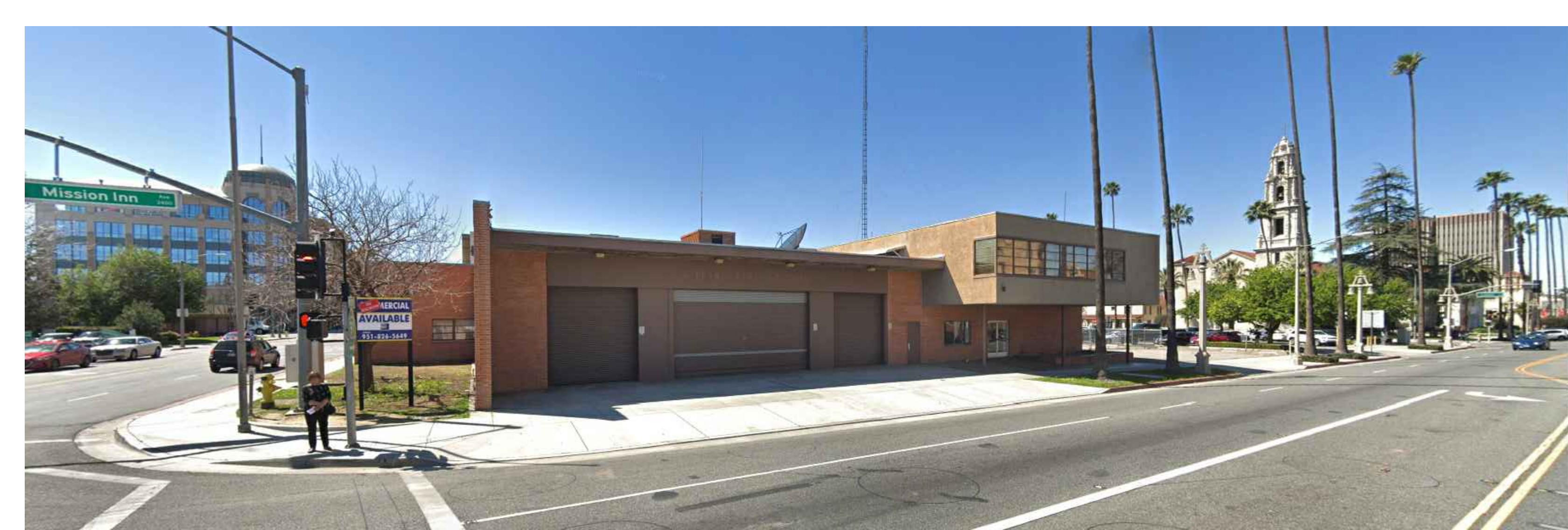
3. SITE VIEW AT MISSION INN BLVD.