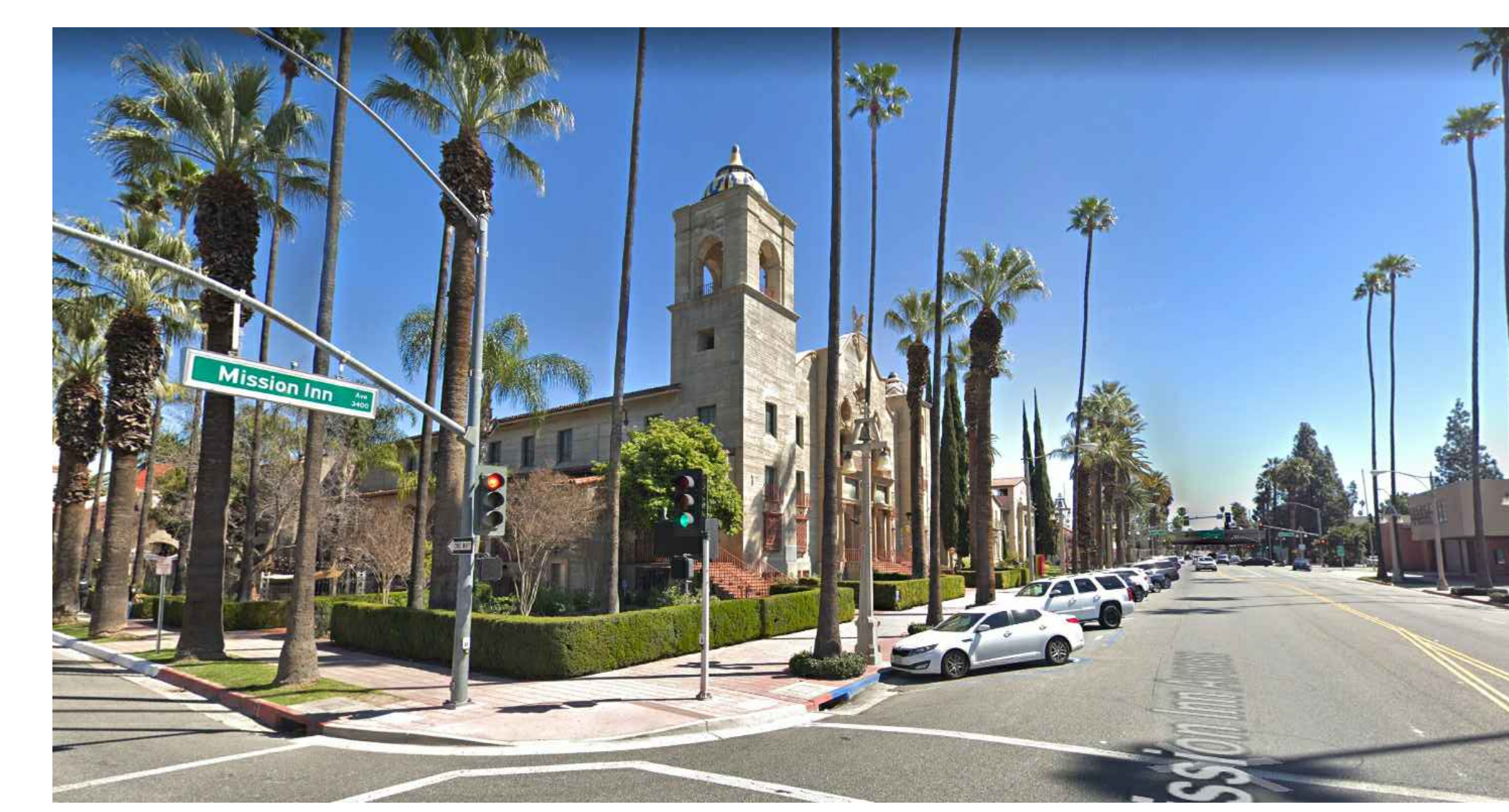
7. MISSION INN BLVD WEST VIEW