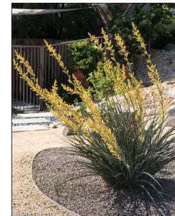
Hesperaloe parviflora 'Yellow'

CCA INC CUMMINGS CURLEY AND ASSOCIATES, INC. LANDSCAPE ARCHITECTS 3633 LONG BEACH BOULEVARD, SUITE 300 LONG BEACH, CALIFORNIA 90807 TEL. 562.424.8182 CA 3583 AZ 30100 NV 578 TX 3337 UT 377204 CLARB 319