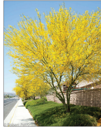
Parkinsonia x 'Desert Museum'