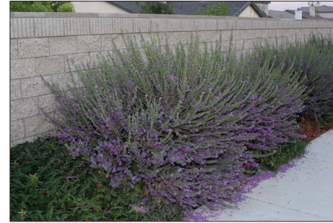
Leucophyllum langmaniae 'Rio Bravo'