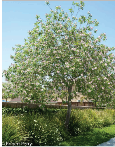
x Chitalpa tashkentensis