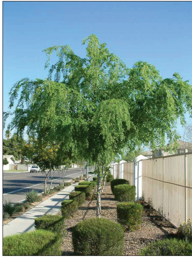
Ulmus parvifolia 'True Green'