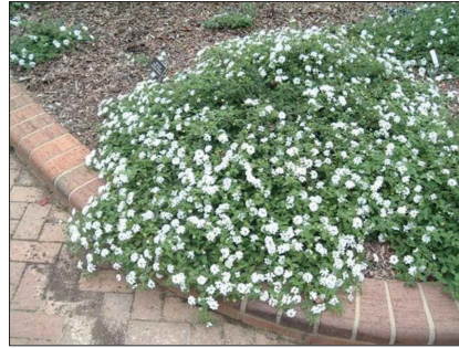
Lantana montevidensis 'White Lightnin'