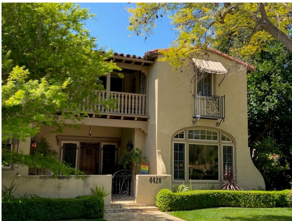
Front (street) Elevation