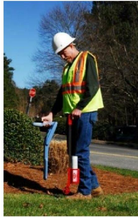
Typical underground facility locating process