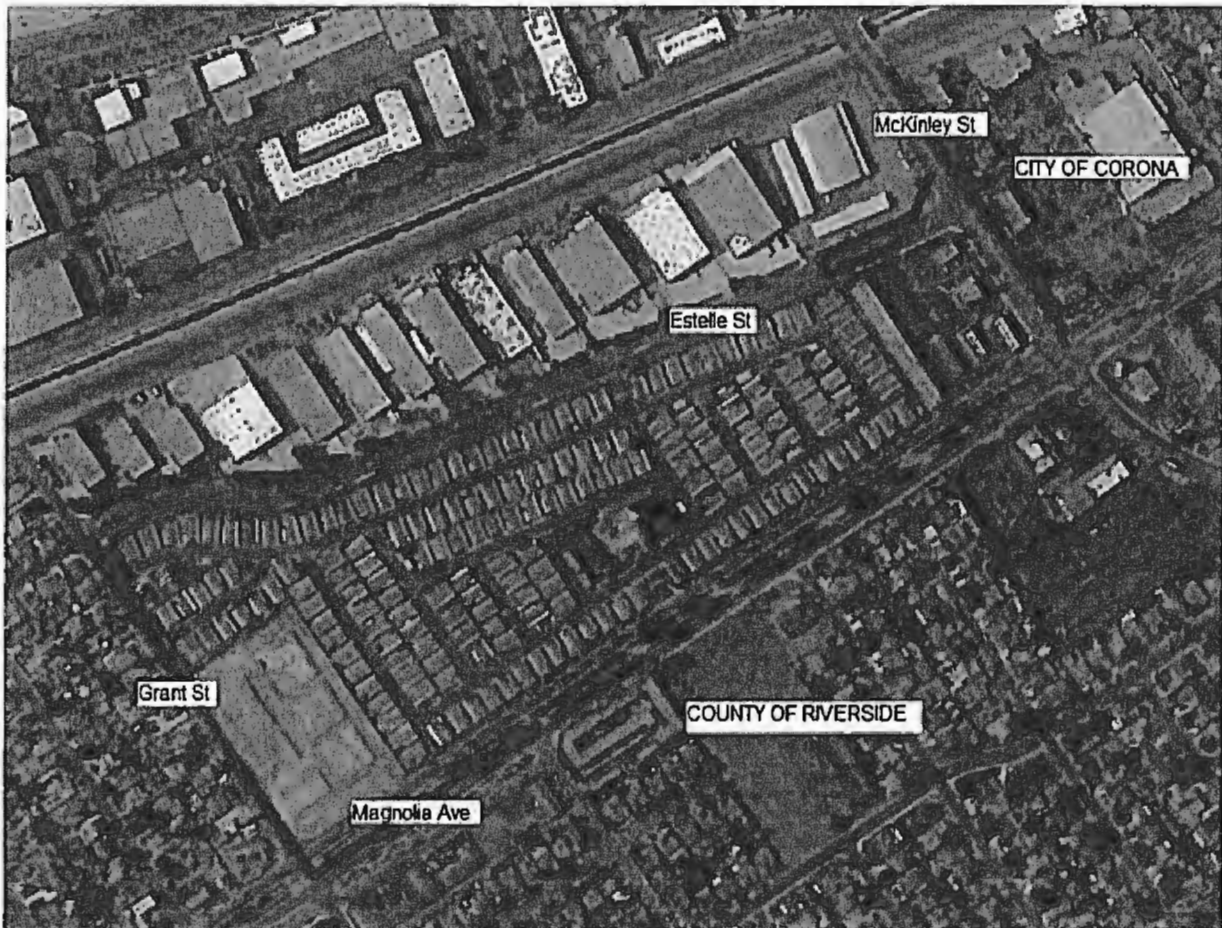
PROJECT AREA

The designated Construction Inspector will provide the required services to successfully complete the project.