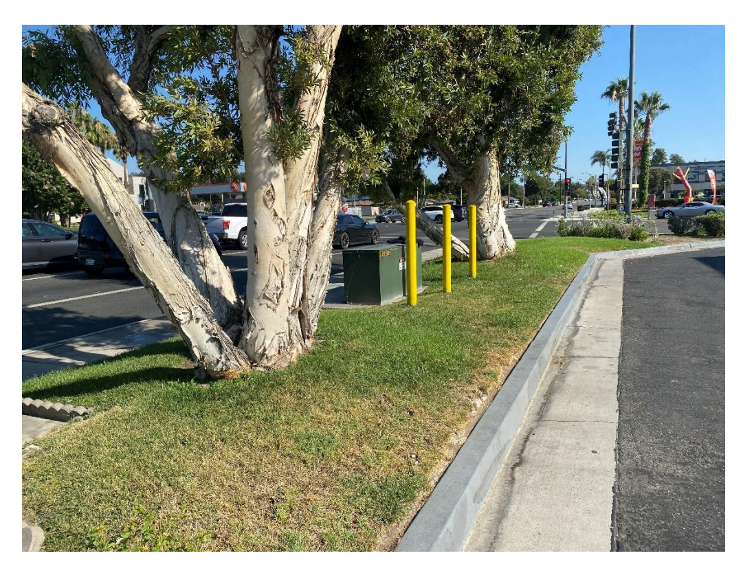
Location for proposed transformers and switchgears along Riverside Avenue.