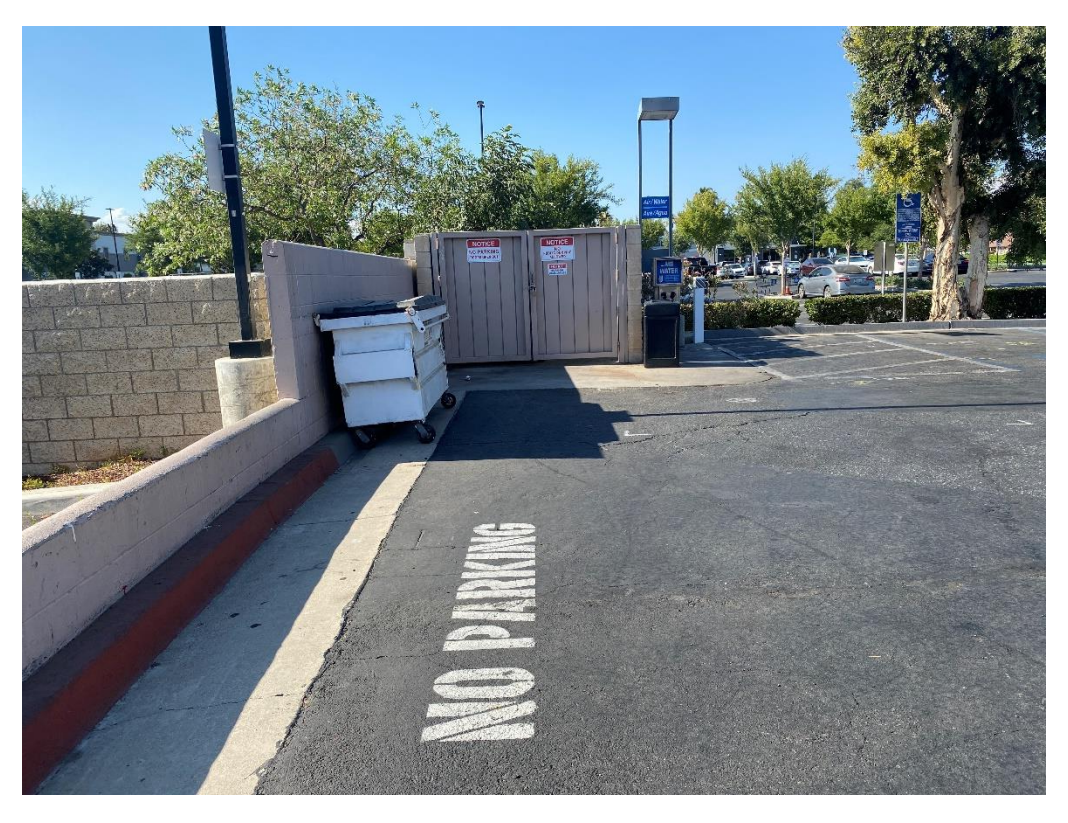
Northwest area for proposed outdoor equipment and trash enclosure.

PR-2021-001055, Exhibit 3 – Existing Site Photos