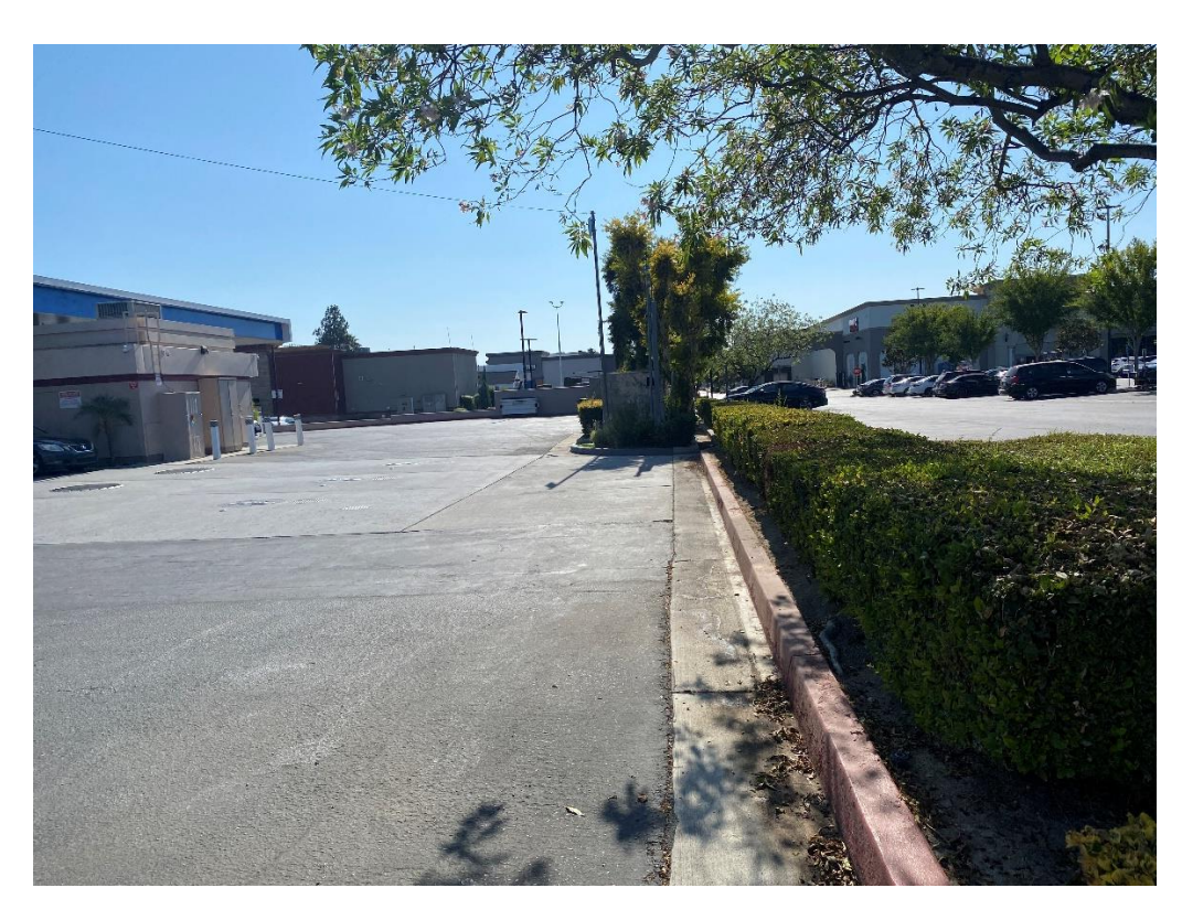
Riverside Avenue looking west at project site.