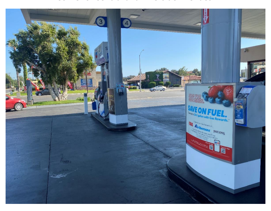
Existing fuel dispensers and location for proposed hydrogen fuel dispensers.

PR-2021-001055, Exhibit 3 – Existing Site Photos