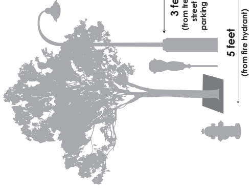
Diagram 3 (not to scale)