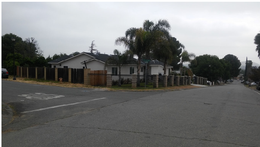
DOVERWOOD DR AT COLLEGE AVE