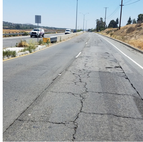
VAN BUREN BOULEVARD