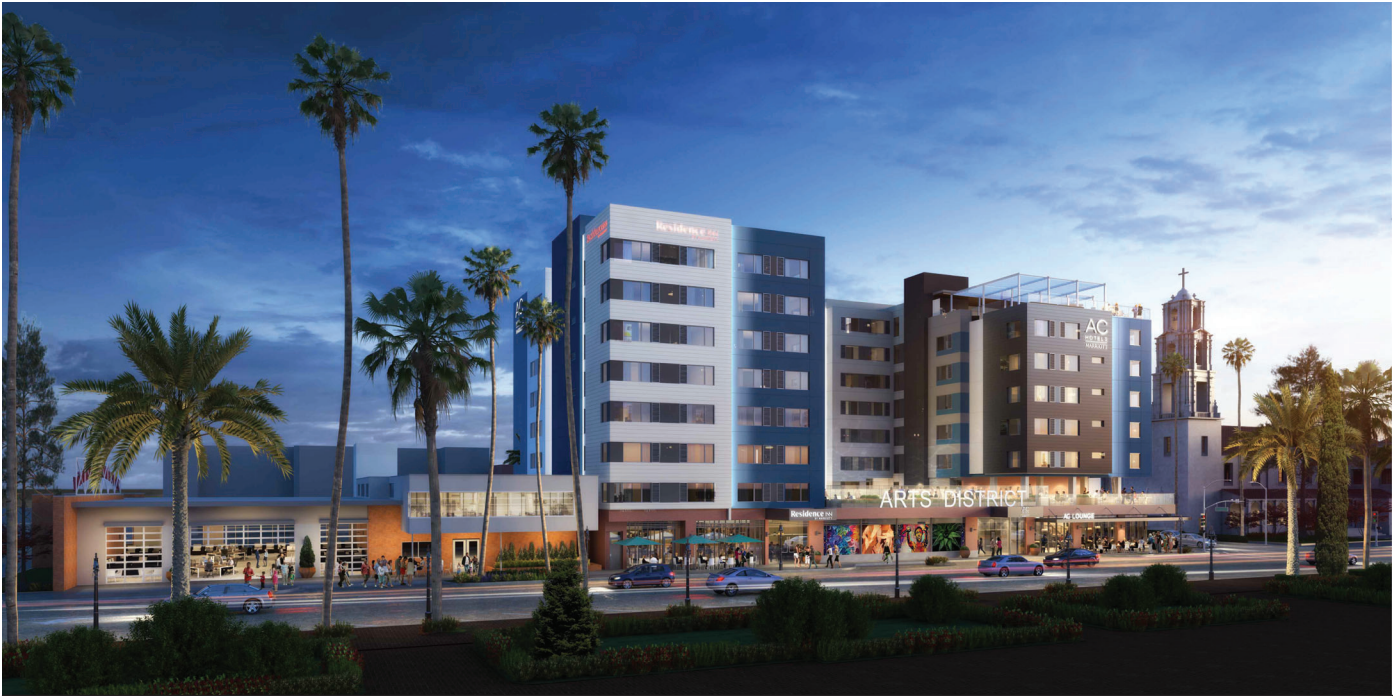
EXISTING HISTORIC BUILDING AT MISSION INN AVE AND LIME ST