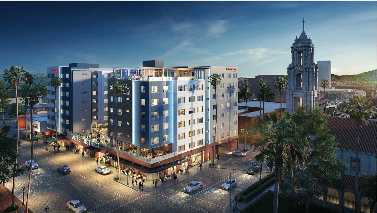
AERIAL VIEW - MISSION INN AVE AND LEMON ST. SCALE: NTS