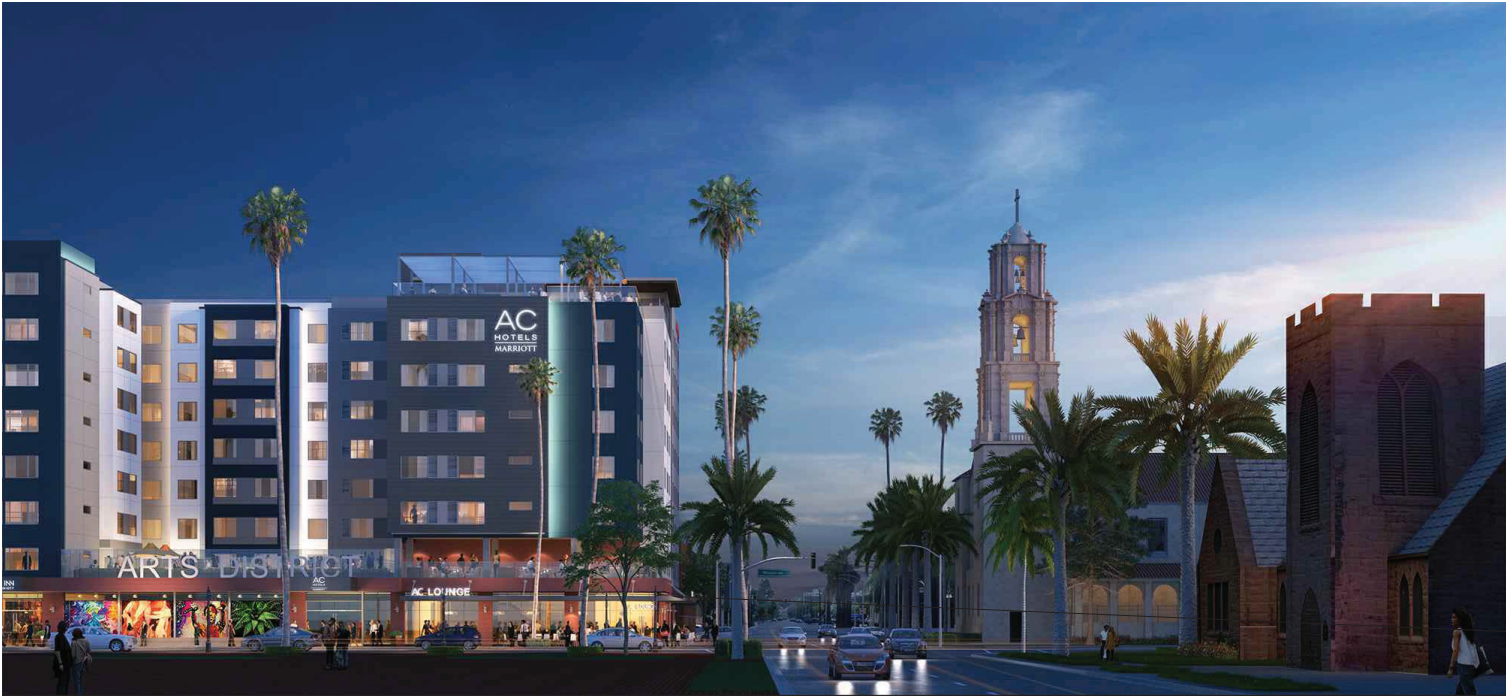
STREET VIEW AT MISSION INN AVE SCALE: NTS