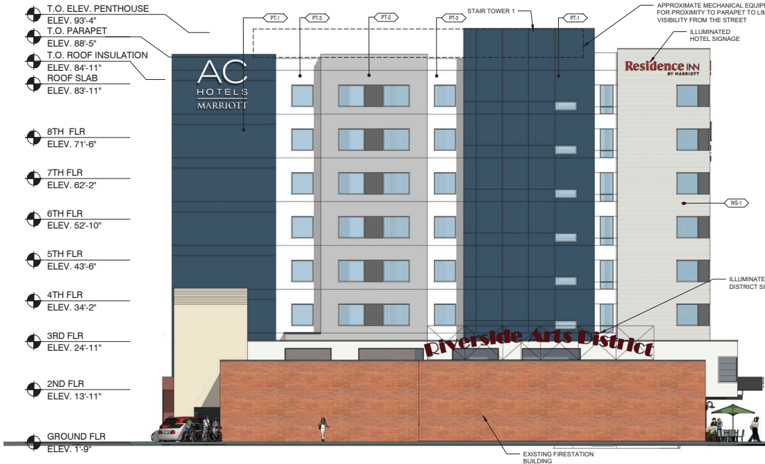
EAST ELEVATION (LIME ST)