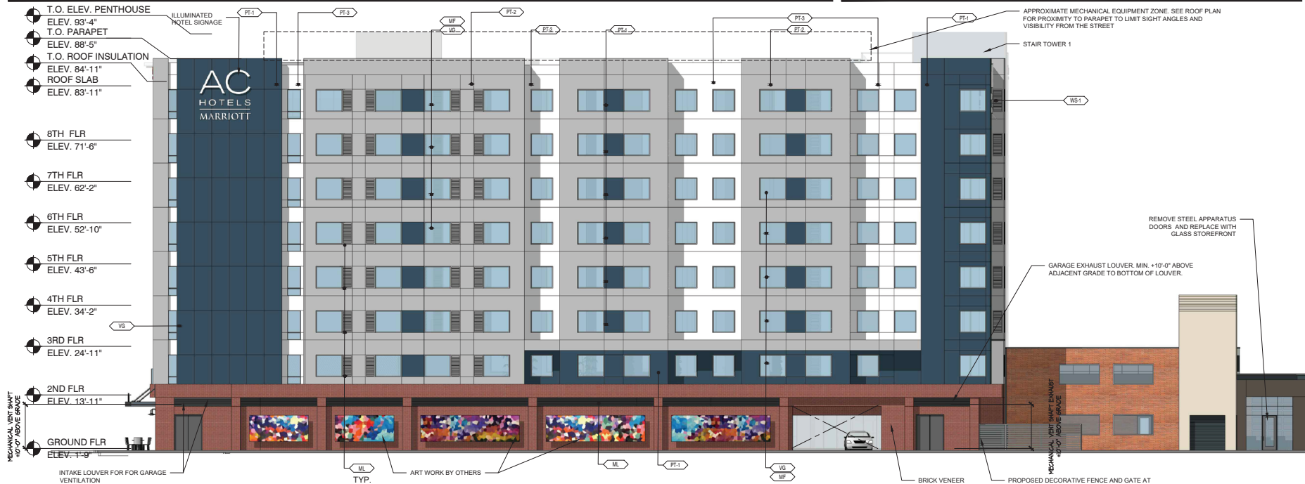
SOUTH ELEVATION (ALLEY)