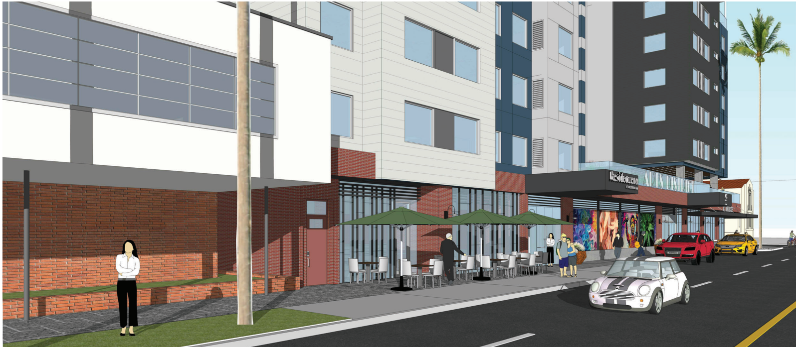
ENTRY VIEW AT RESIDENCE INN SCALE: 1/8" = 1'-0"