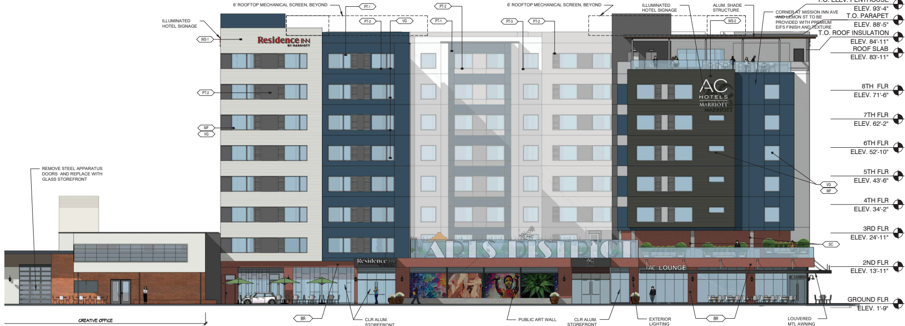
NORTH ELEVATION (MISSION INN AVE)

A.L.G. = ABOVE LOWEST GRADE - AT CURB LINE IN FRONT OF HOTEL PROPERTY LOWEST CURB LINE = 858.38' (SEE CIVIL DRAWINGS) AND IS THE 0'-0" REFERENCE POINT IN THE ELEVATIONS AND SECTIONS