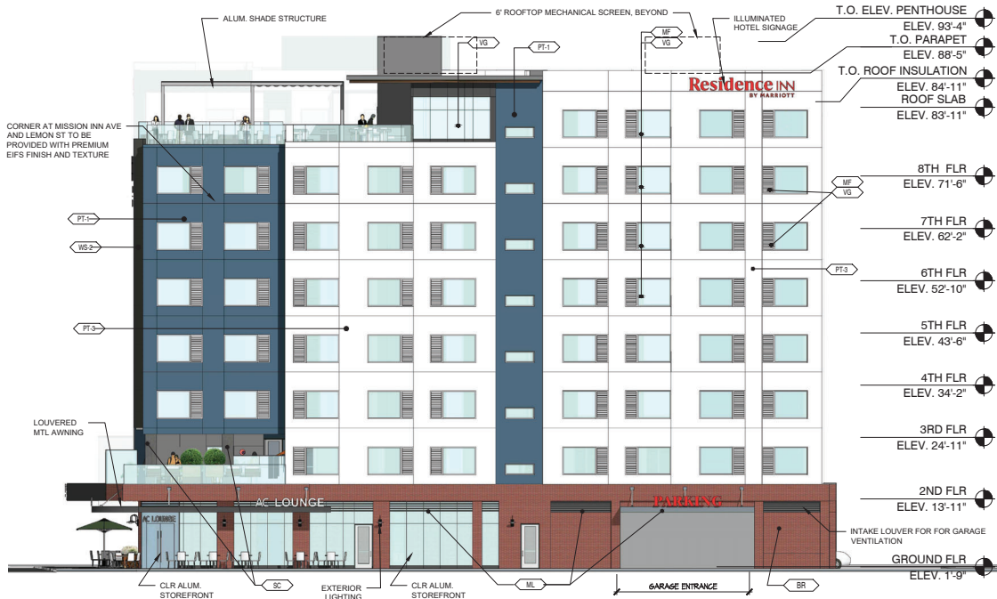
WEST ELEVATION (LEMON ST)