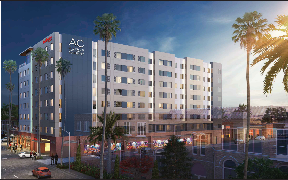
HOTEL AT LEMON ST AND THE ALLEY