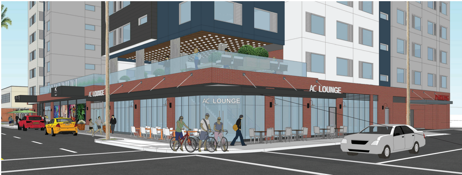
ENTRY VIEW AT AC LOUNGE SCALE: 1/8" = 1'-0"