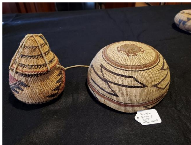
Woven Basket from Hoop Valley