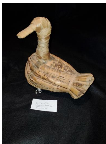
Southern Paiute tribe