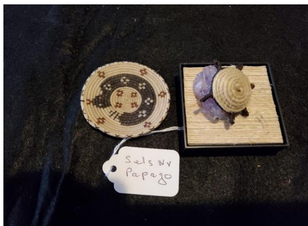
Tohono O'odham (left); SW Apache (right)