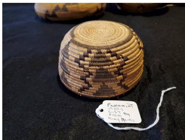
Panamint 1920's Gift Bag From King Marks