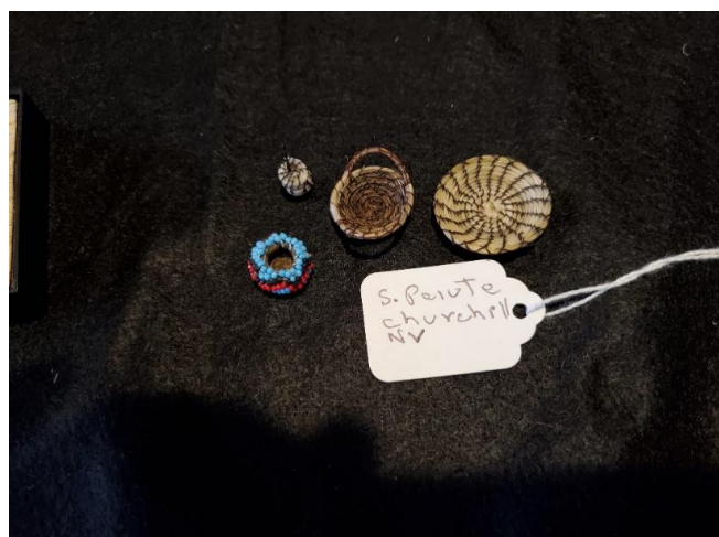
Southern Paiute tribe