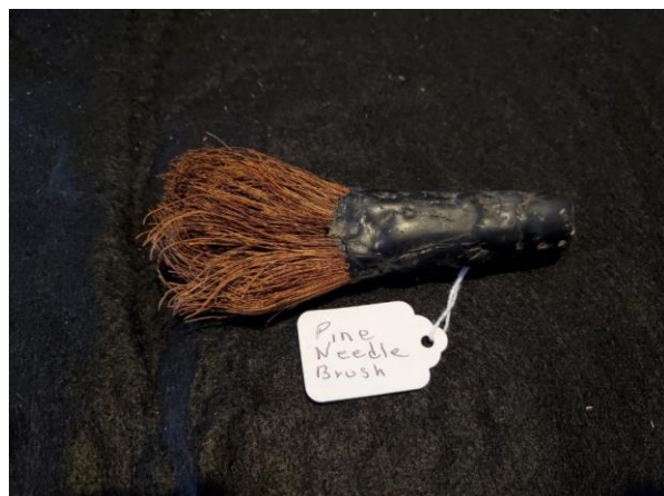
Pine Needle Brush