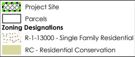
SD-2024-00001 (VC) Exhibit 5 - Zoning Map