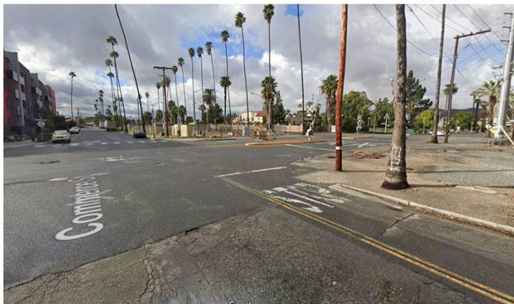
MISSION INN AVENUE