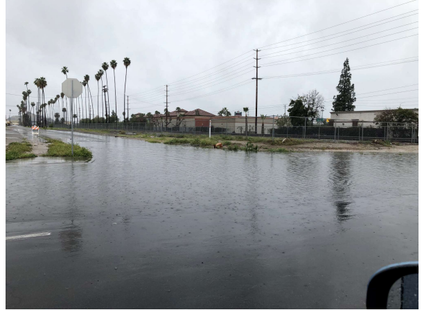
THIRD STREET X COMMERCE STREET FLOODING (Proposed Grade Separation Location)