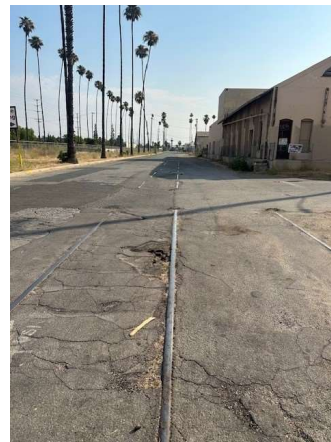
COMMERCE STREET LOOKING TOWARDS NORTH