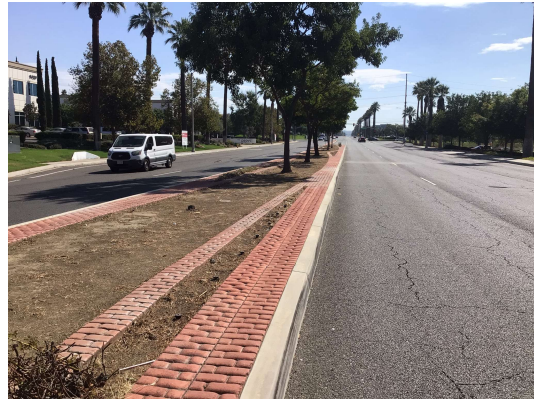
IOWA AVENUE N/O MARLBOROUGH AVE