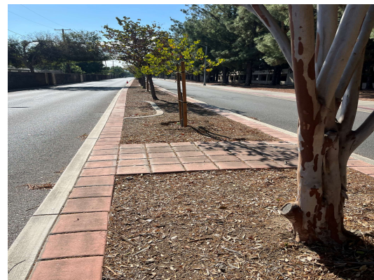
HUGHES ALLEY W/O OMAR ST