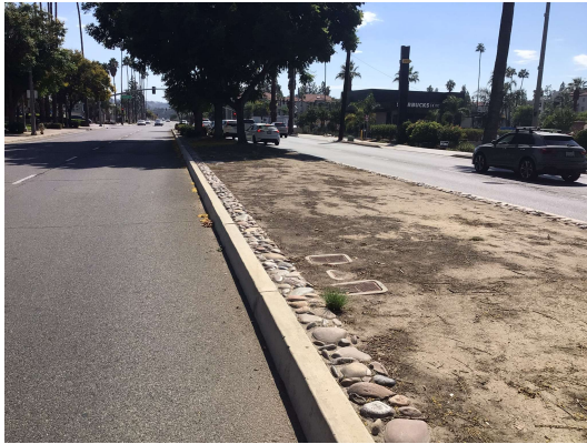
IOWA AVENUE N/O UNIVERSITY AVE