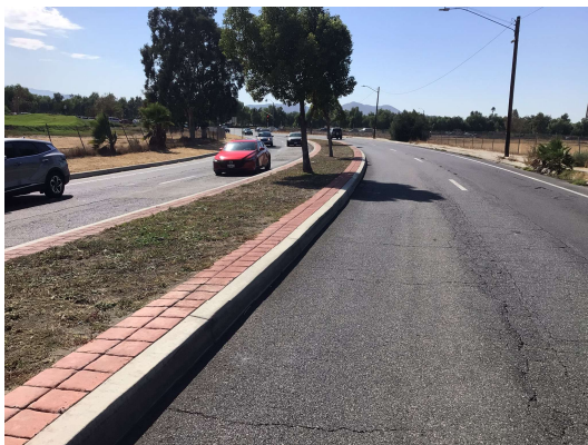
CENTRAL AVENUE E/O VAN BUREN BLVD