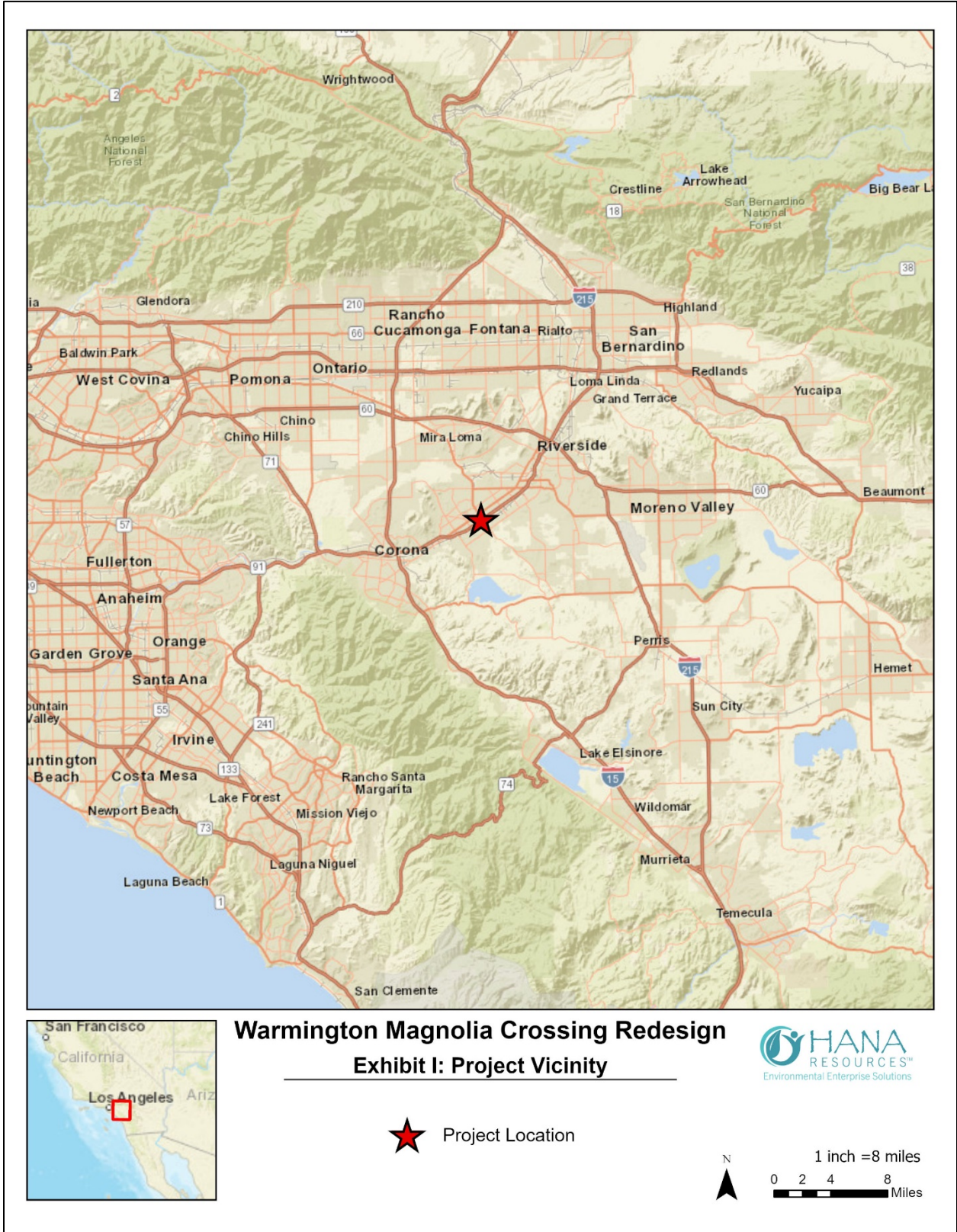
Exhibit I: Project Vicinity Map