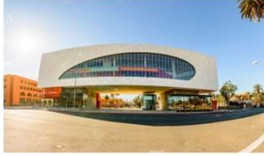
Administration 9.00 FTE