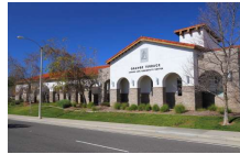
Neighborhood Public Services 65.5 FTE