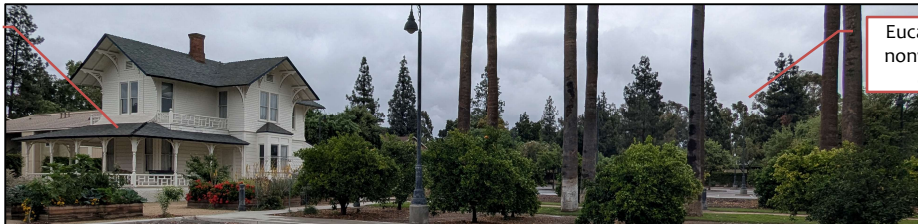
Eucalyptus tree, nonvisible in the distance