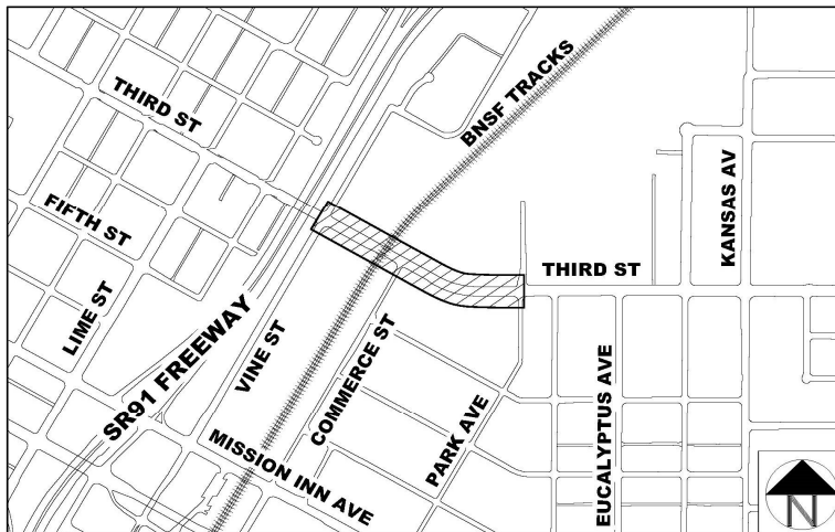
THIRD STREET GRADE SEPARATION FROM VINE STREET TO PARK AVENUE