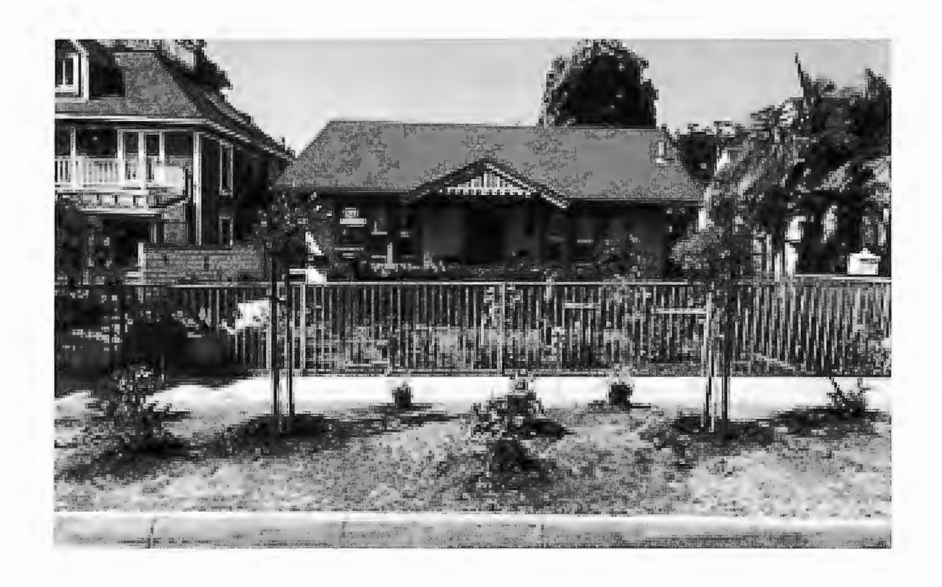
Exhibit "C" 4466 Eleventh Street