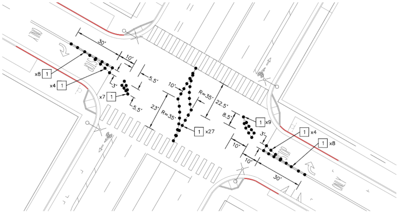
Figure 2: Signing & Striping Plan of the actual implementation during the 1-month pilot period in June 2024

and westbound left turn and through movements as part of the 12-month pilot project and to be consistent with the Fox Plaza Project EIR.