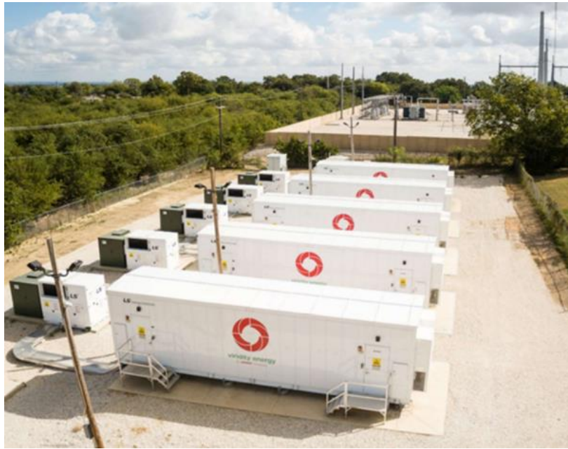
Figure 1: Battery Energy Storage Facility

Unfortunately, as the state of California has begun more aggressively retiring its older natural gas generation assets, a supply shortage in available merchant RA has developed. Since 2019, merchant RA market prices have reflected increasingly volatile year-over-year price increases. Table 1 shows the average cost of RA in the summer months since 2019, as reported by Southern California Publicly Owned Utilities in a recent California Energy Commission (CEC) RA proceeding. Figure 2 shows the corresponding average annual cost of RA graphically for the same period.