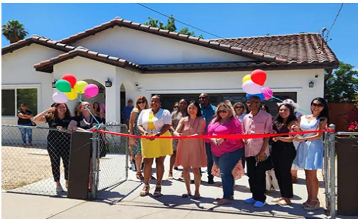
*Photo of previous Walden property acquisition