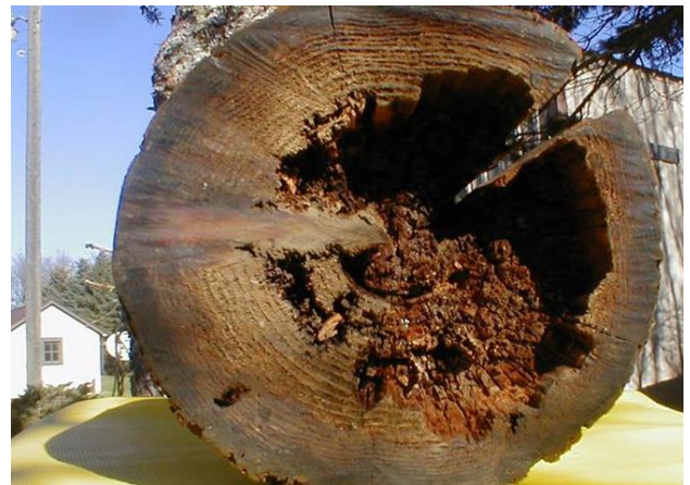
Internal pole decay

On December 14, 2023, Bid RPU-8058 was posted to PlanetBids with a non-mandatory pre-bid meeting scheduled for January 10, 2024, and had six (6) contractors attended. Prior to bid closing on February 1, 2024, RPU received 28 questions and answers and issued two (2) addenda. One vendor submitted a bid for the inspection program. Upon Purchasing Division review for responsiveness, it was determined that the overhead inspection Bid RPU-8058 be awarded to Osmose Utilities Services.