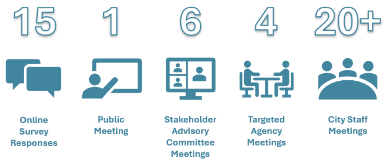
Figure 2: Comprehensive Community Engagement Summary

The VMT Mitigation Program project included extensive outreach to educate and receive input from stakeholders and the public as noted in Figure 2.