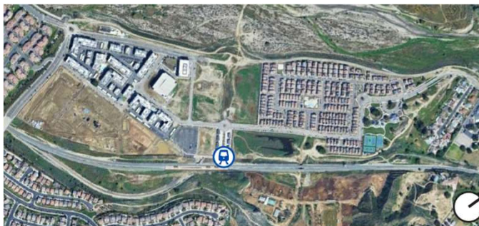
EXAMPLE: VISTA CANYON, SANTA CLARITA TOD PROJECT