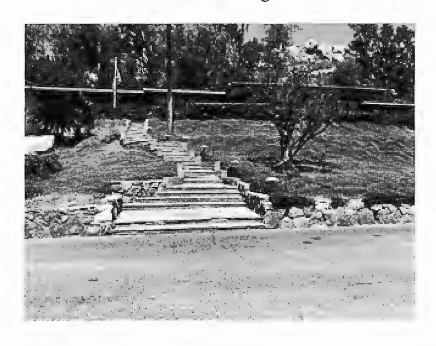
Exhibit "C" 3881 Loring Drive