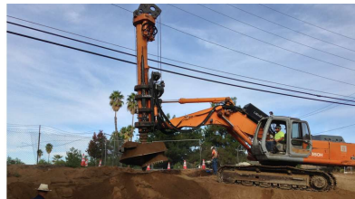
DRILL RIG AT WORK