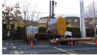
OFFLOADING CABLE REEL AT JOB SITE