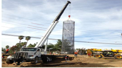
SETTING REBAR CAGE