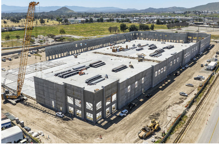
Riverside Logistics Center – April 2024 Construction update