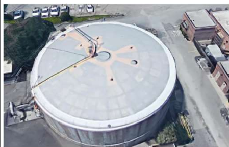
Roof view of Digester 5