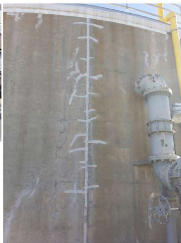
Concrete crack of Digester 5