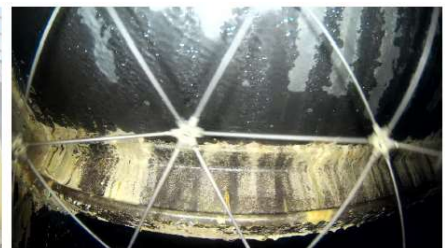
Interior View of Digester 5