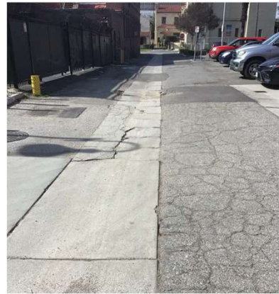
ALLEY N/O UNIVERSITY AVE