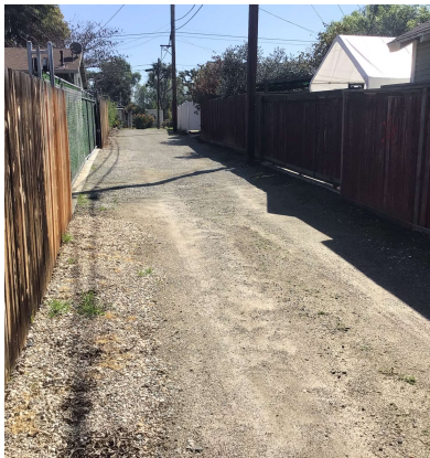
ALLEY N/O THIRD ST