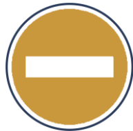
Traffic Control Signage