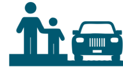
Sidewalk, C/G Install/Repairs