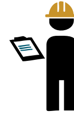
Construction Contract Administration