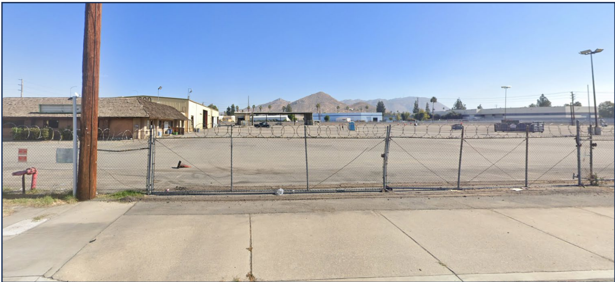
Facing east from Chicago Avenue