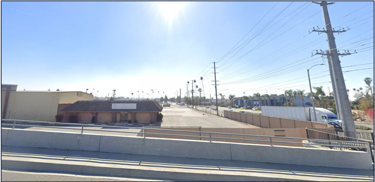
Facing south from Columbia Avenue