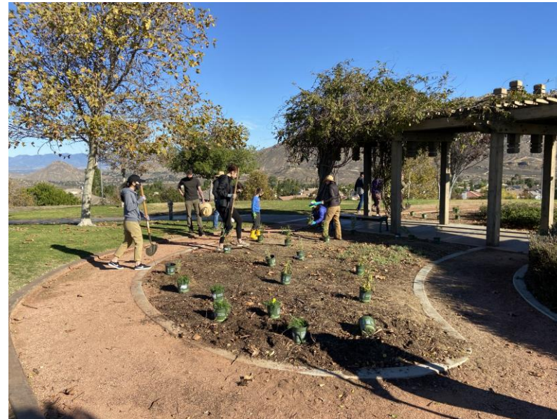
Sycamore Highlands Park