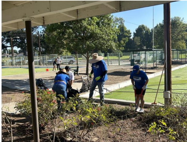
Fairmount Park Lawn Bowling