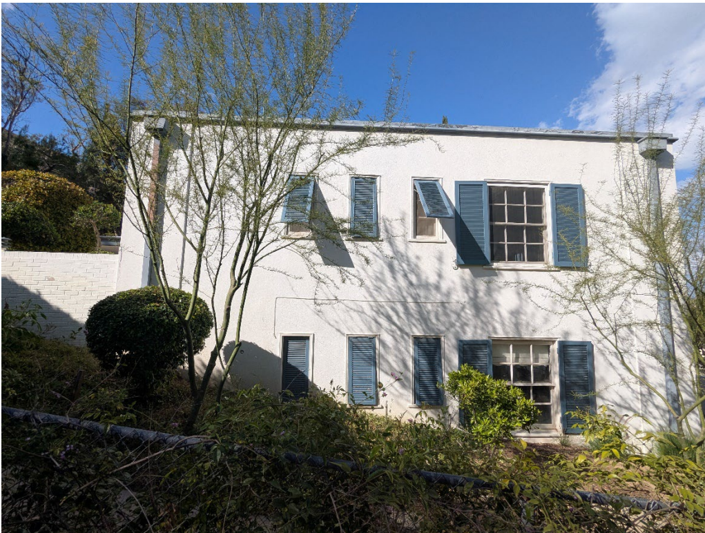
Figure 2 - South elevation, view looking north