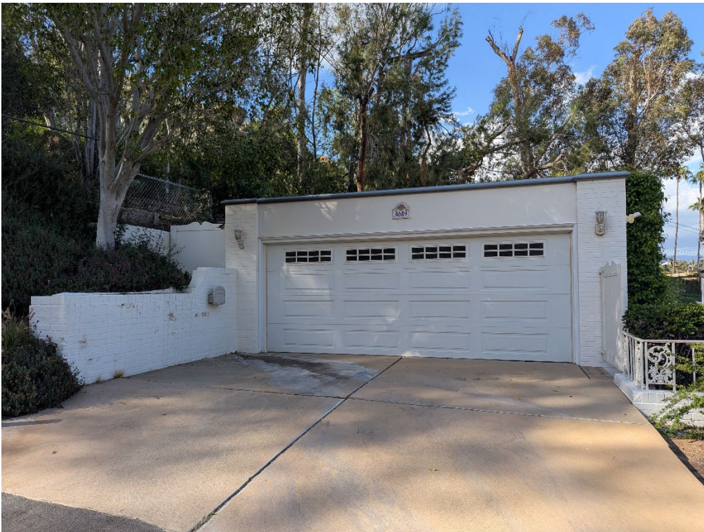
Figure 10 - Detached two-car garage