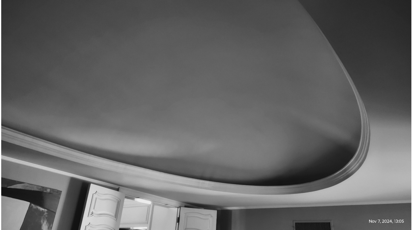
Figure 9 - Entry interior - oval recessed ceiling