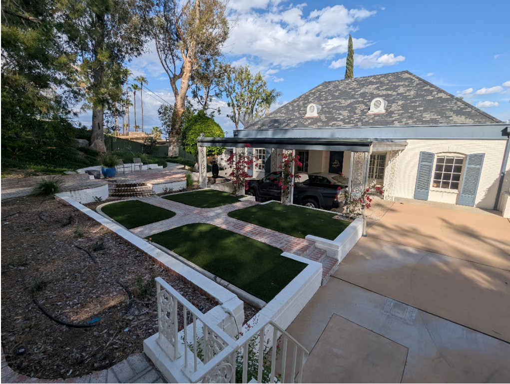
Figure 1 – Main façade (west) Elevation, view looking northeast