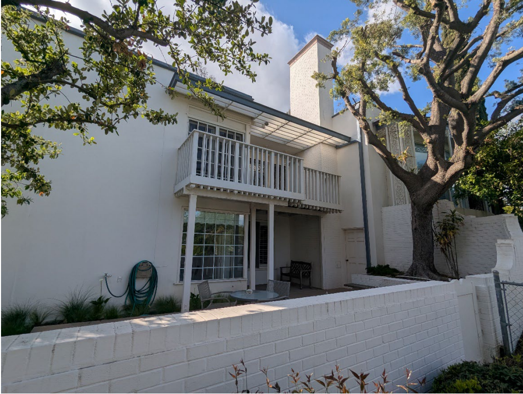
Figure 3 – Loring Drive (east) Elevation and southeast courtyard, view looking northwest