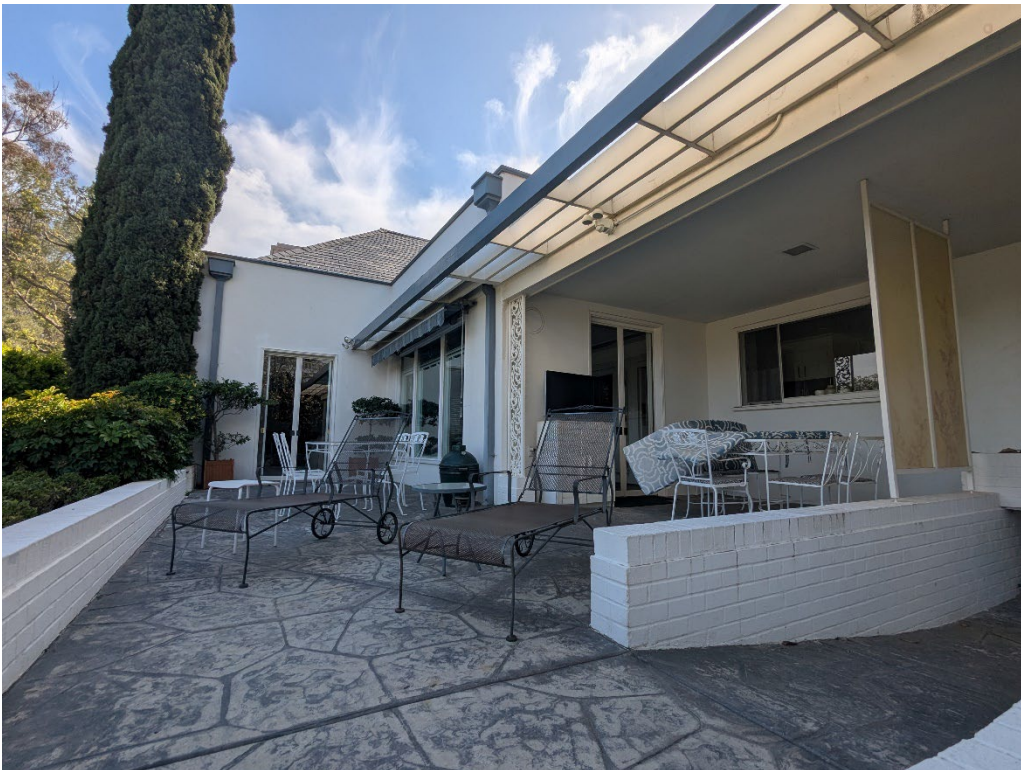
Figure 4 – Loring Drive (east) Elevation and northeast courtyard, view looking southwest