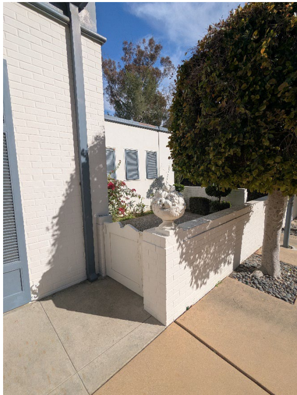
Figure 8 - Example of Regency design features (urn)