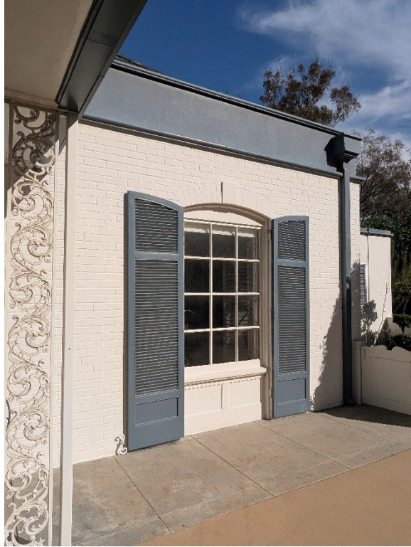
Figure 7 - Example of segmented arch topped window openings and tall/narrow shutters