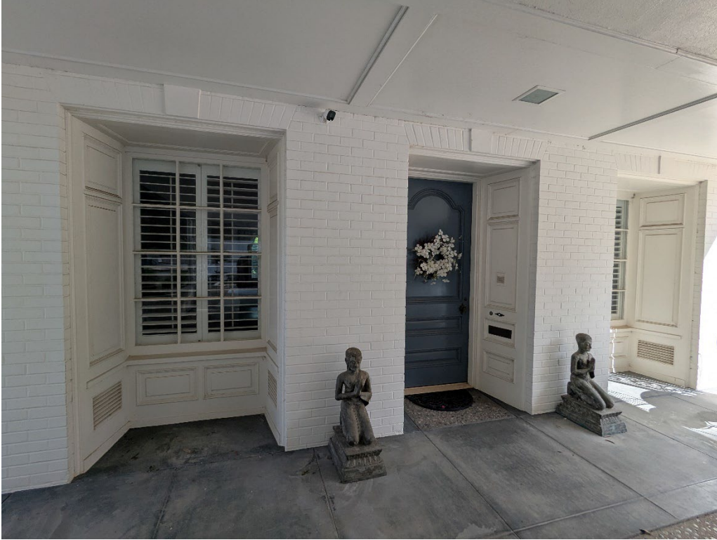
Figure 5 - Main entry area, view looking southeast